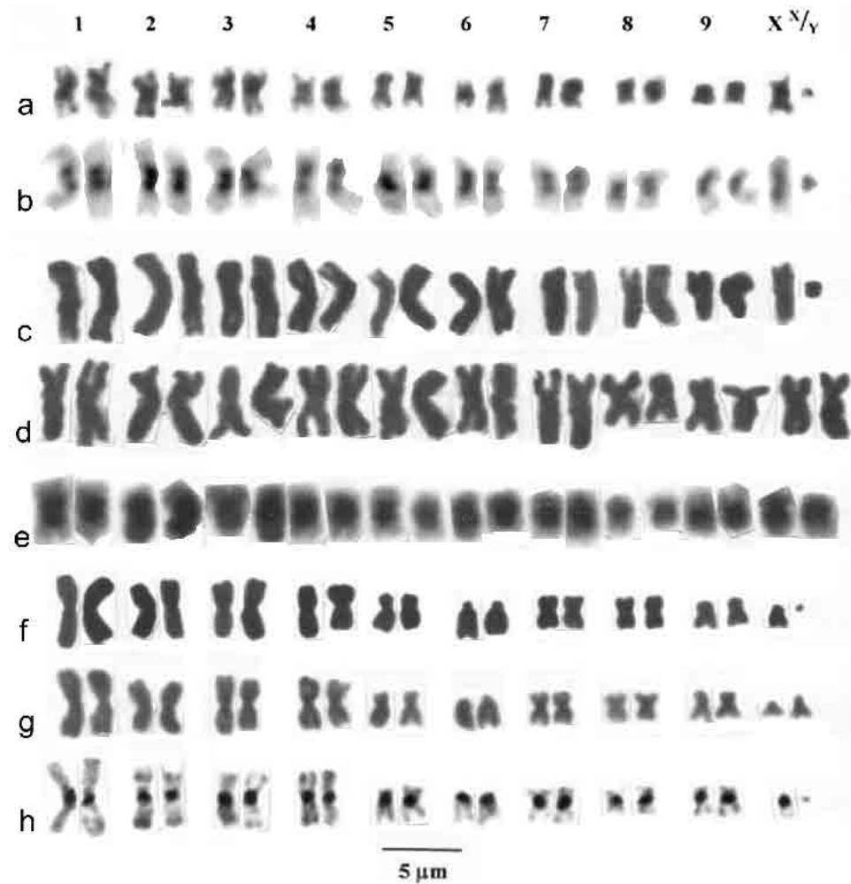
Fig. 3: Mitotic chromosomes from mid-gut cells of Chilo thorax species; a, b : A. lineolatus , Tarifa, ♂, the same specimen, a plain, b C-banded; c - e : A. paykulli , Box Hill, c ♂, plain, d ♀, plain, e ♀, C-banded; f - h : A. sticticus , f ♂, Ilfracombe, plain, g ♀, Chalfont St Giles, plain, h ♂, Martyr's Green, C-banded.

Aphodius rufipes . Fig. 1g, h. Published information: 2N = 20 (♂), 9 bivalents + Xy (VIRKKI 1951). 2N = 18 + Xy . The autosomes range in RCL from about 14 to 7, and the X chromosome is about as long as autosome 4, RCL about 10.5. Autosomes 1 - 6 and 8 are submetacentric, while autosomes 7 and 9, and the X chromosome, are metacentric. The male karyotype (Fig. 1g) is partly C-banded and shows distinct centromeric C-bands similar in size to those of A. luridus . The long arms of autosomes 1 and 2, and the short arm of autosome 5, show distinct secondary constrictions, which in this preparation appear as gaps rather than C-bands.